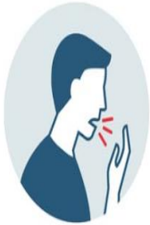
NEW PERSISTENT COUGH