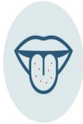
LOSS OF TASTE